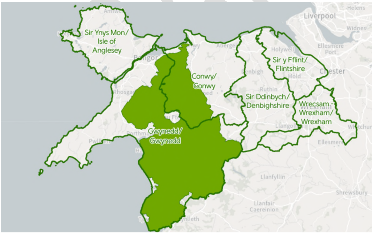
Figure 1 – Area Considered in the North Wales Regional Transport Plan (ENPA Area in Green).

This area, which is shown in Figure 1, also includes the area (solid green) managed by the Eryri National Park Authority (ENPA). This is included because when CJCs are exercising the function of preparing Strategic Development Plans, the relevant National Park Authority (NPA) is also a member of the CJC. When doing anything that impacts on a NPA area, CJCs will need to consider how they can further support the purposes of NPA to conserve and enhance the natural beauty, wildlife, and cultural heritage of the National Parks; and promote opportunities for the understanding and enjoyment of the special qualities of the park by the public.